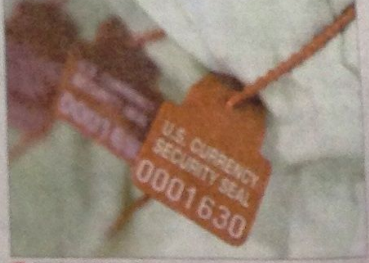
IN UNBROKEN SEAL: The security seal ensures. money is loaded with a small fortune including. that the bags have never been searched after being filled with U.S. currency at the World Reserve.