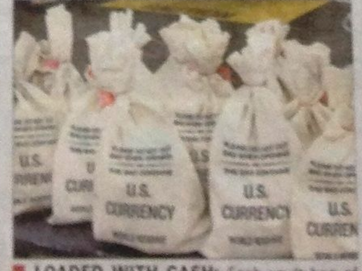
# LOADED WITH CASH: Each vault bag of scarce, uncut, old and rarety seen U.S. currency.