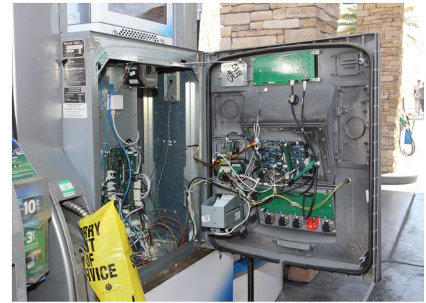
A skimmer behind a gas station pump.