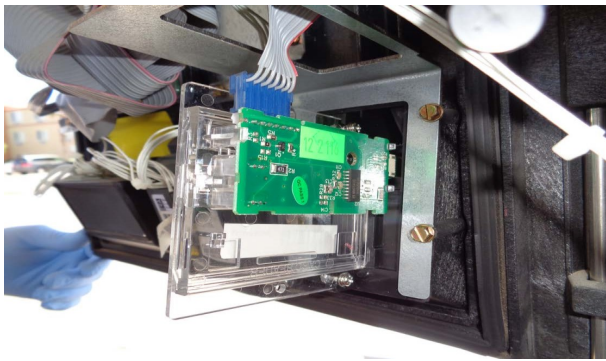
A skimmer installed inside an ATM.