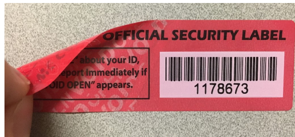
Not all security tape is the same, and colors vary. However, the general principle is the same. This is an unsecured security label. Note the word "void" across the face of the tape.