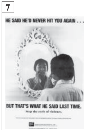
“He Said He’d Never Hit You Again...” (Asian American Woman)