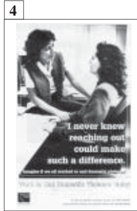
“I Never Knew Reaching Out Could Make Such A Difference”