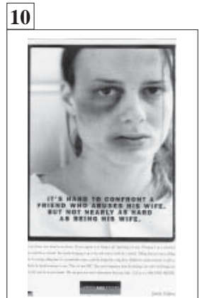
“It’s Hard To Confront A Friend Who Abuses His Wife. But Not Nearly As Hard As Being His Wife.”