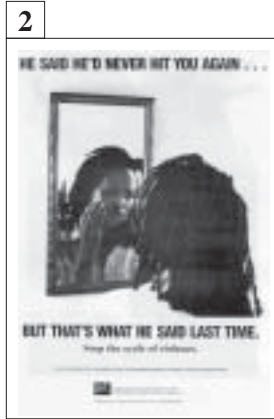
“He Said He’d Never Hit You Again...” (African American Woman)