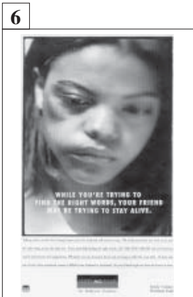
“While You’re Trying To Find The Right Words, Your Friend May Be Trying To Stay Alive.”