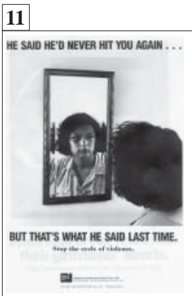
“He Said He’d Never Hit You Again...” (Latina Woman)