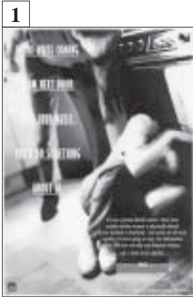
“If the Noise Coming From Next Door Were Loud Music, You’d Do Something About It”