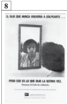
“El Dijo Que Nunca Volvería A Golpearte...” (Latina Woman)