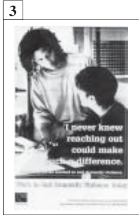
“I Never Knew Reaching Out Could Make Such A Difference”