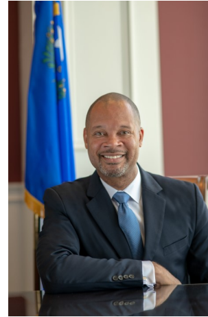
Aaron D. Ford Nevada Attorney General

Office of the Attorney General Carson City Office 100 N. Carson St. Carson City, NV 89701 (775) 684-1100 Fax - (775) 684-1108