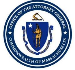
MAURA HEALEY ATTORNEY GENERAL