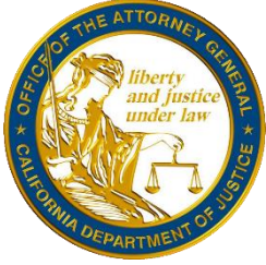
XAVIER BECERRA ATTORNEY GENERAL